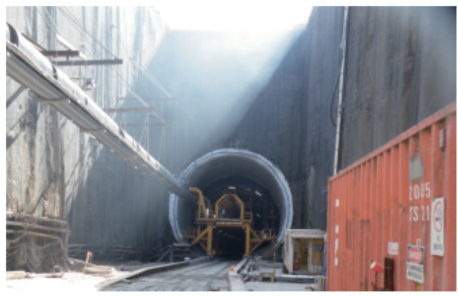
The entrance to the monster tunnel, which will be over 10 km long

A "monster" project: HOSCH Company installs a special HD underneath the City of Niagara Falls