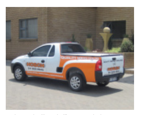
Striking - the "branded" service vehicles

Six new service vehicles have already been branded with the striking new design and some more will follow - in any case all the new service vehicles replacing old ones. Johan de Koker: "The service technicians are very proud of the logos and will definitely be noticed now on the plants when servicing. Customers actually phoned me to say that they like the concept and that our vehicles are standing out from the rest now".