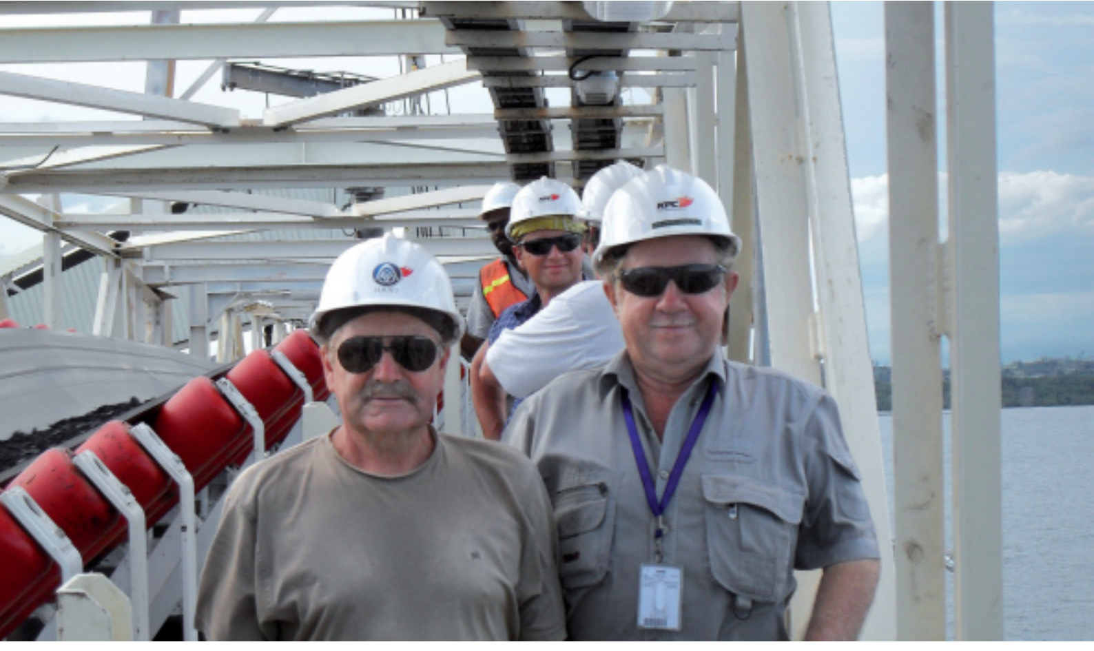
On site: Employees of ThyssenKrupp St. Ingbert and KPC