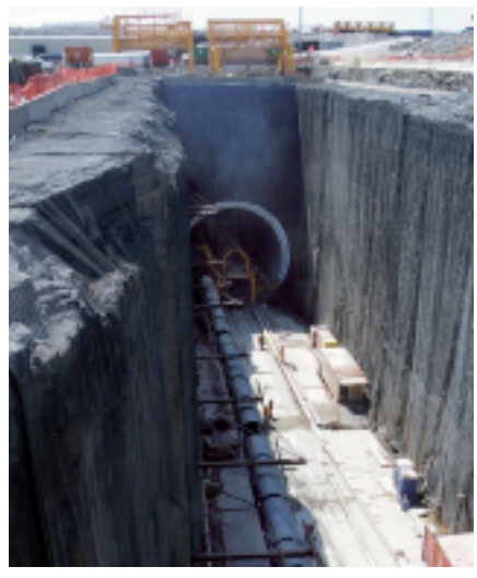
The tunnel under the City of Niagara Falls has been drilled since the year 2005 – its completion is scheduled for this year