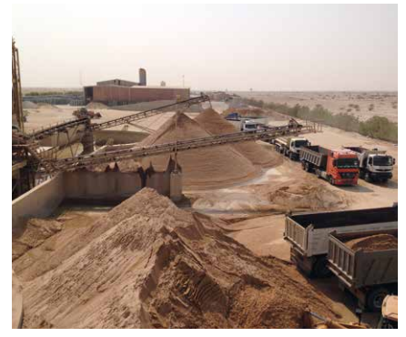
The largest sand-washing plant in the world just outside Doha, the capital of Qatar.

Not surprisingly, the world's largest sand-washing plant, owned by the Qatar Industrial Manufacturing Company, can be found in Doha (more precisely, in Umm Bab just outside Doha), the capital of Qatar with a population of nearly one million. Since production started in 1992, the plant has washed 12 tonnes of sand annually, according to QIMC. This gigantic facility boasts eight huge sand-washing machines and 50 belt conveyors with a width of 800 - 1,000 mm. The conveyors transport the contents of 750 mining cars at a speed of 1.5 meters per second.