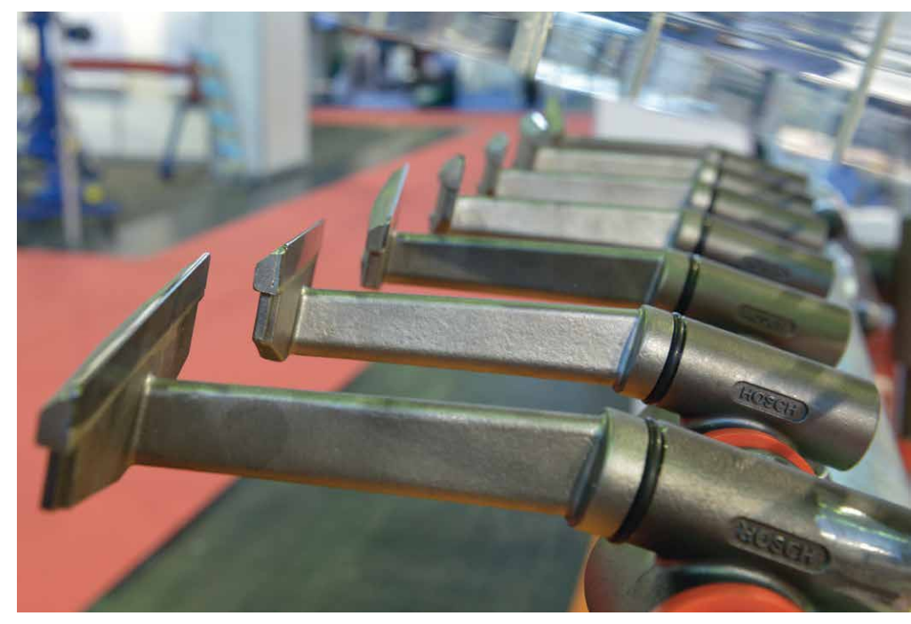
Type D scraper: easy to handle, convenient, fast and safe.

The time-tested HOSCH Training Program (HTP) now includes units on the Type D scraper, of course. A tabletop model has been developed especially for the training: It consists of a short assembly carrier with two mounted modules. As a result, the trainees had a chance to actually mount and dismantle all components. A 16-page manual with special emphasis on service completes the training documentation.