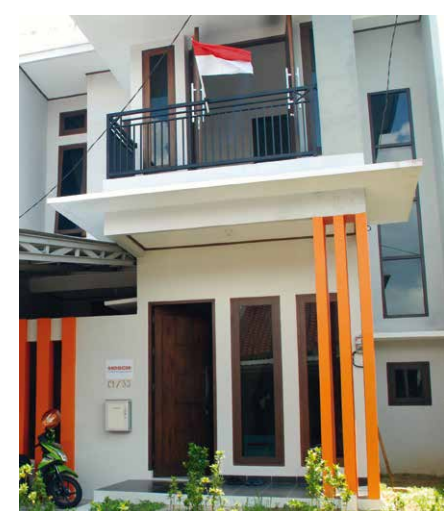
The new HOSCH building in Indonesia: offices and warehouse on the ground floor, living quarters on the second floor.

As of October 2015 HTI is headquartered in Balikpapan (population: 430,000) located in the Indonesian part of Borneo on the eastern part of the island. The most important industries are: production of crude oil, processing of crude oil at several refineries, and export of oil and oil products via a large harbor. The fact that