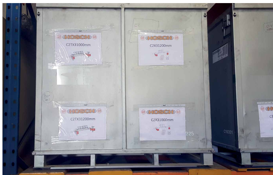
Every box has four chambers for the different HOSCH products.