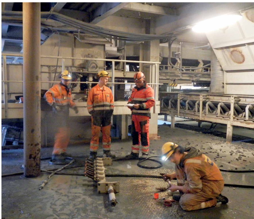
Maintenance work on a Type C3 scraper.

in Asker, a western suburb of the Norwegian capital Oslo, right on the Oslo Fjord.