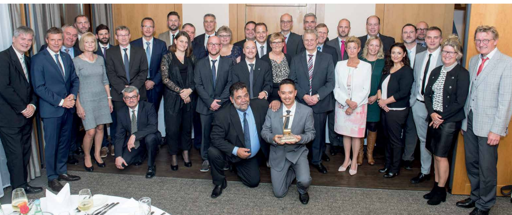
Participants at the IMM 2017 with guests at the grand gala dinner in Jammertal.