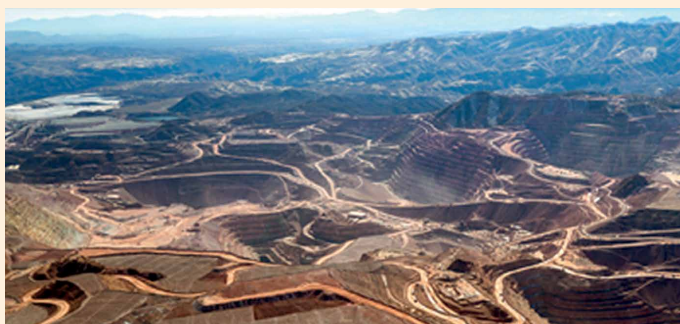
Copper is produced at numerous open-cast mines in North America.

cooperation, HOSCH Company helped to solve fundamental cleaning problems in a sustainable manner at both locations. The long service life of the special HOSCH blades for these applications in copper mining also ensured shorter maintenance intervals. The customers are highly satisfied with the initial results achieved and have indicated that they may also use HOSCH products in their other mines.