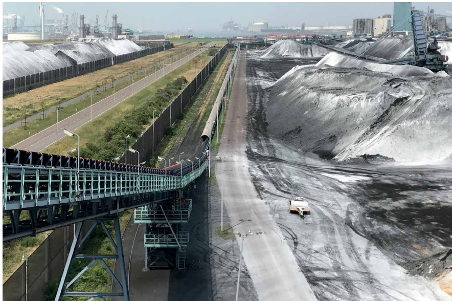
EECV imports approx. 30 million tonnes of iron ore and coal annually – most of it destined for the thyssenkrupp steel plant in Duisburg.