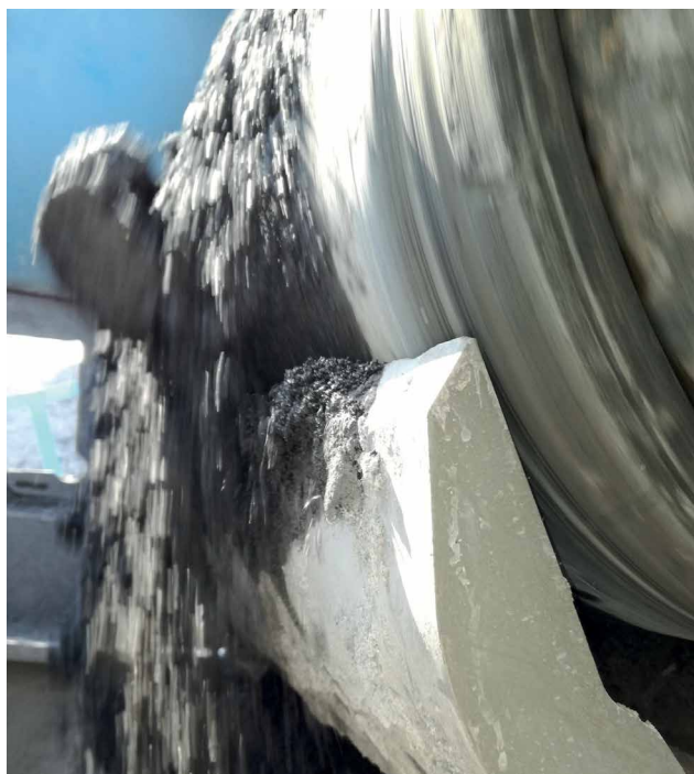
The HD-PU-L prescraper deployed in tunnel construction in South Tyrol.

At the beginning of November, after three months of continuous operation, the HOSCH scrapers had won 100% approval from the tunnel builders. The