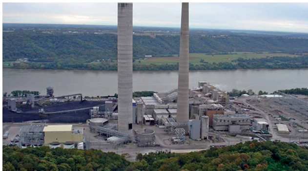
The Clifty Creek power plant in Kentucky (U.S.) is right on the Ohio River, a tributary of the Mississippi.

The Clifty Creek power plant is located on a site covering 820 hectares (about 2,026 acres) along the Ohio River – a tributary of the Mississippi – in southern Indiana in the U.S. Each of the six generators has a capacity of 217.26 megawatts, giving a total capacity of 1,303.56 megawatts – enough to supply power for a city with one million inhabitants.