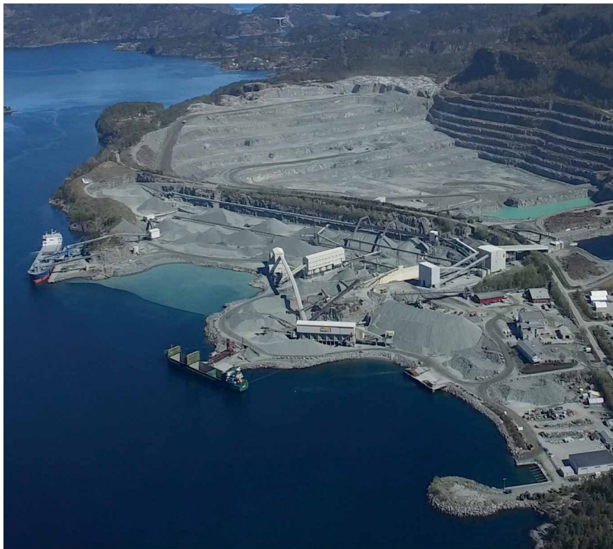
The Norsk Stein A/S facility on the Jelsa fjord near Stavanger is the largest quarry in Europe.

HOSCH Norway (NUF) was founded about two and a half years ago, on July 1, 2015. The company is part of