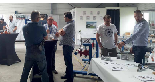
Intensive discussions between customers and HOSCH employees.

work hours went into preparing for the event.”