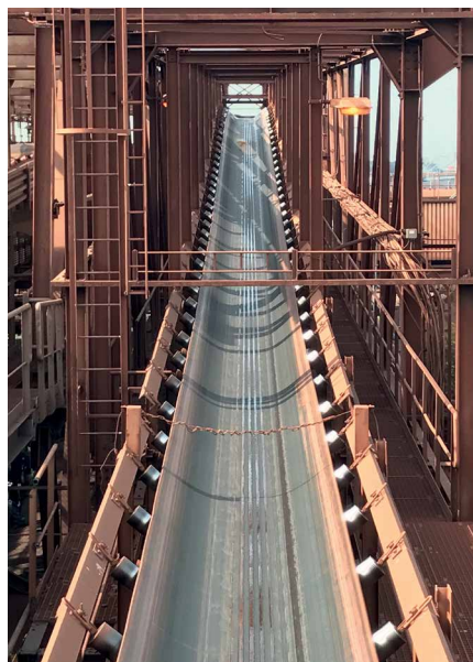
The conveyors in the Rotterdam facility.

no share responsibility for the international HOSCH business: "With over one hundred scrapers in the facility, the contract covers not just HOSCH products. We will also be servicing systems from competitors," they explained.