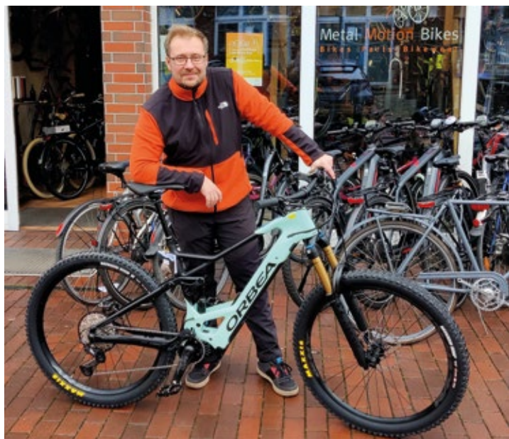
With your own bike to work or to the customer - HOSCH supports this with an attractive benefit for all employees.

cycling alone is no fun. The online procedure for leasing a business bike is very simple. The employer registers on the "eurorad" portal and then the HR department approves portal access. After that, employees can visit a dealer to choose a suitable bike. The sky's the limit where prices are concerned – although the new bike must cost at least 999.99 euros. A contract for using the business bike is concluded before HOSCH starts booking the costs against the employee's gross salary. HOSCH is also subsidizing the monthly leasing fee (which includes comprehensive insurance) with 10 euros. After the 36-month