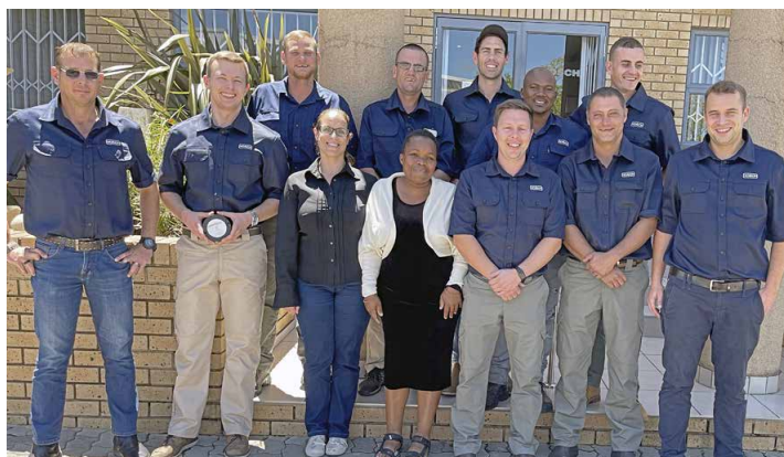
The HOSCH South Africa team after their training in Johannesburg.